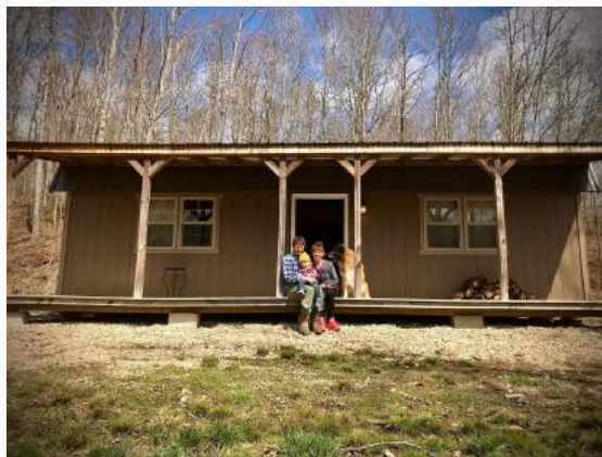
Benton's on the Baileys, a short-term vacation rental in Athens County, is one of the many new and thriving businesses that have sprung up around the project's recreation assets.

ORCA provides a new level of functionality to this collaborative effort by serving local governments in proven development strategy implementation, operation of recreation assets as social enterprises, and securing impact investments. As lead applicant, ORCA will continue to work with the current group of expert partners and others to ensure holistic benefits of outdoor recreation are realized in the 7-county project area.